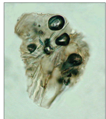
Figure 1: Tephra (width about 40µ) from the AD1158 eruption of Hekla found in peat from the Lofoten Islands.

there is probably no part of the globe from which such deposits are absent. The use of Icelandic tephra in stratigraphic studies and as a dating tool is well developed in NW Europe. Tephra particles are usually less than 100 micrometers (commonly 20-60µ in diameter) and are glass (Fig. 1). In all the studies described here, the tephra is invisible in the cores and sections and must be detected microscopically. The ideal medium for detection of minute traces far from the parent volcano is a highly organic matrix such as peat. The tephra can be released by burning sub-samples of the organic material and dissolving the peat ash in dilute acid. The